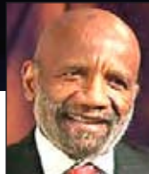
Lerone BENNET, JR.