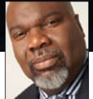
Bishop T.D. JAKES